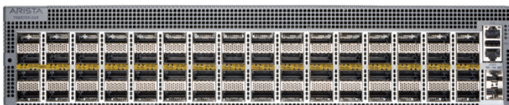
Arista 7060DX5-64S: 64 x 400GbE QSFP-DD ports, 2 SFP+ ports