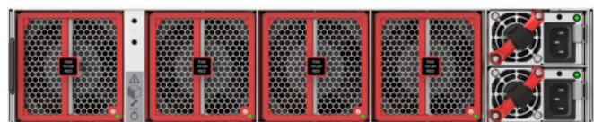
Arista 7060X5 2RU Rear View: Front to Rear airflow (red) AC Powered