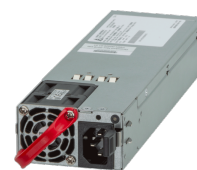
2.4kW Hot swap power supplies