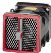
2U Hot swap fan modules